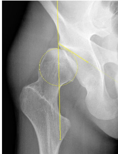
Figure 2: Normal hip. Notice the femoral head is fully covered and the socket is horizontal.