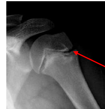
6 weeks after rest