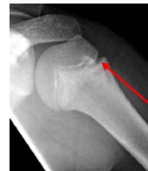
3 months after rest