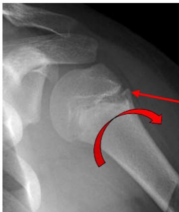
Widening of growth plate from torsional stress