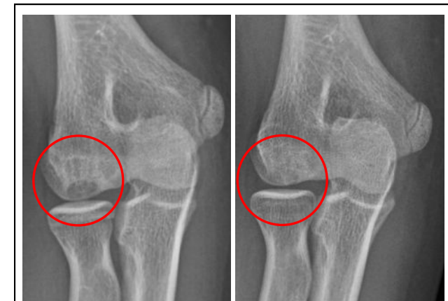
Pre-Operative x-ray showing an OCD lesion before treatment with drilling