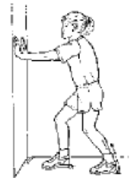
Heel Cord Stretch (Achilles Tendon)